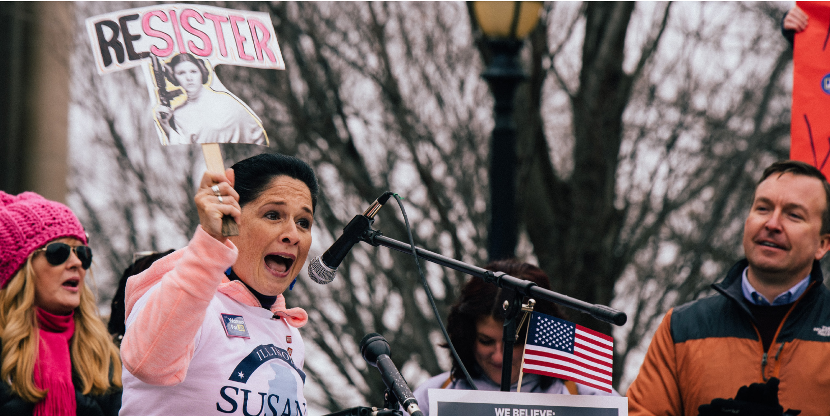
➤ Womens March, 2018