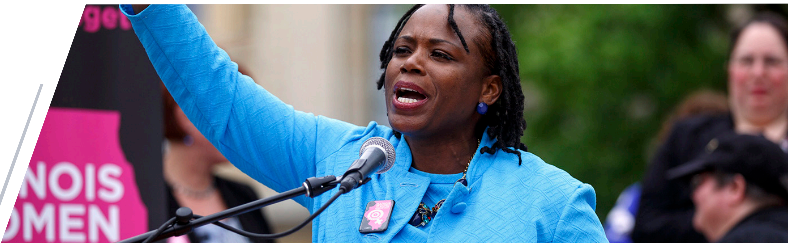
➤ Womens March

Assertiveness is another trait that women candidates are judged more harshly for than men. One Listening Session Participant from Edwardsville said that sometimes ambitious women are viewed as too outspoken or too opinionated, and a Listening Session participant in Champaign similarly observed that women were labeled as “too aggressive,” if they exhibited assertive traits.